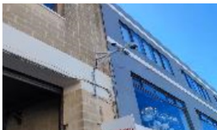
Triq San Gwakkinn

meantime saving the Foundation considerable time and money. The cameras will be monitored by LESA head-quarters 24X7 and access to footage given to the Police on duty at the Central Business District should this be requested.